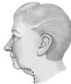
Platysma muscle and its fibrous attachment (SMAS) are sutured tightly in front and behind the ear as an extra sling under the chin